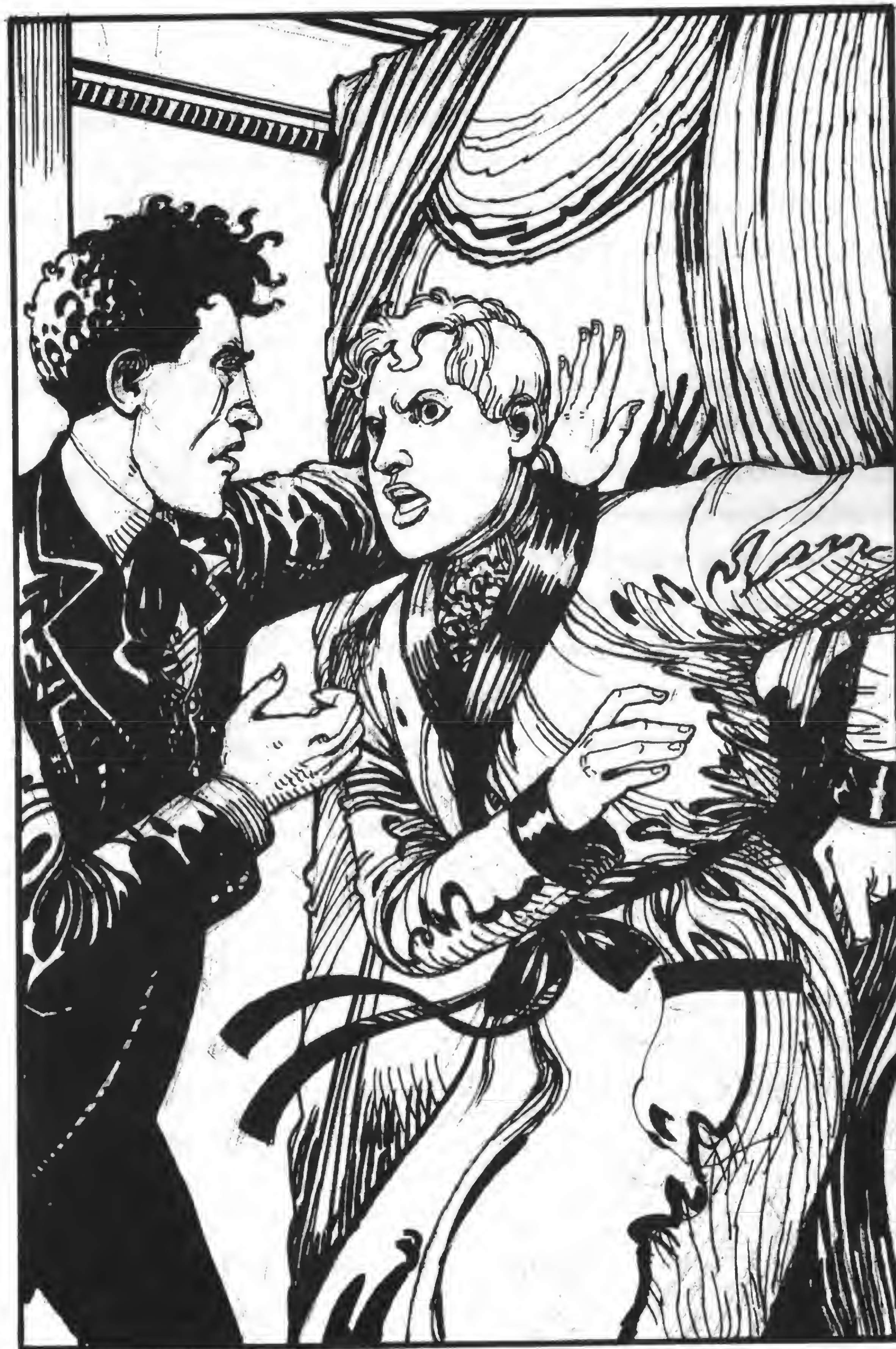
A terrible cry came from Dorian Gray’s lips, and he rushed between the painter and the covered portrait.

Hallward looked at Dorian Gray in surprise. He had never seen him like this before. The boy’s face was white and angry.